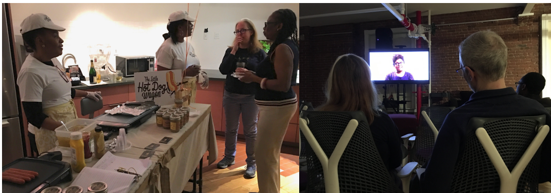
Asingia hosted Dream Galaxy Panel and Film Screening.