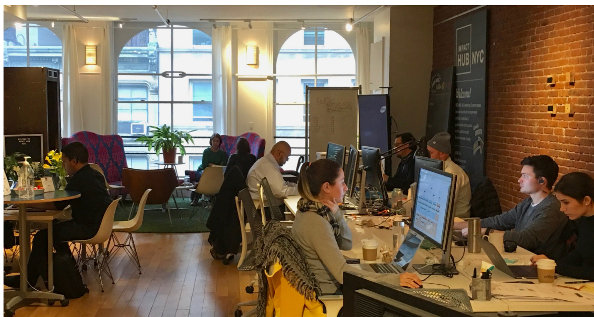
Everyone worked so hard!