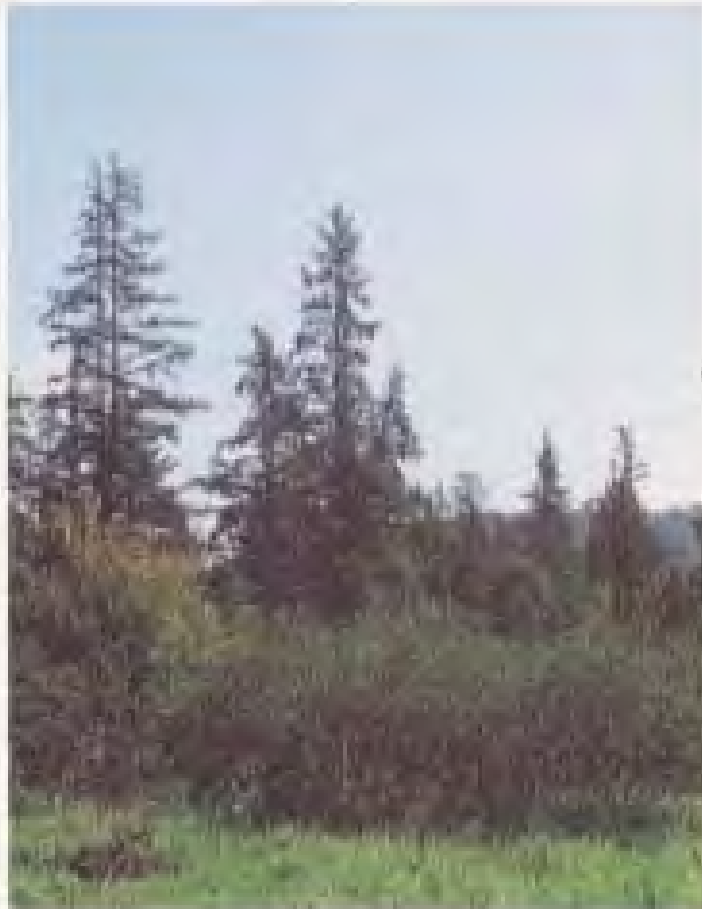
Rosenkrans Bog Natural Area, Clinton County.

Through its recent draft technical guidance documents PADEP appears to be seeking to expand from a strictly acreage-based evaluation of wetland impacts and working instead toward a weighting of functions, indexing to reference ecosystems, and consideration of conditions adjacent to the affected wetland. State methodology also is just beginning to consider cumulative effects on a watershed basis, which is essential for rationally offsetting the negative side effects (externalities) of construction in wetlands. The proposed technical guidance draws conceptually on federally sponsored work on wetland functions that has been underway for twenty years (Smith et al. , 1995) as well as the more recent work by Robert Brooks and his coworkers at Riparia, the Cooperative Wetlands Research Center at Pennsylvania State University. PADEP's current list of functions is displayed below.