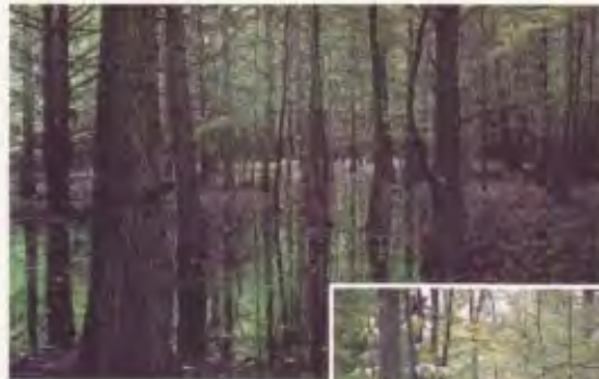
Delhaas Woods, Bucks County.