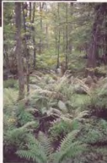
Columbus Bog, State Game Lands 197, Warren County.