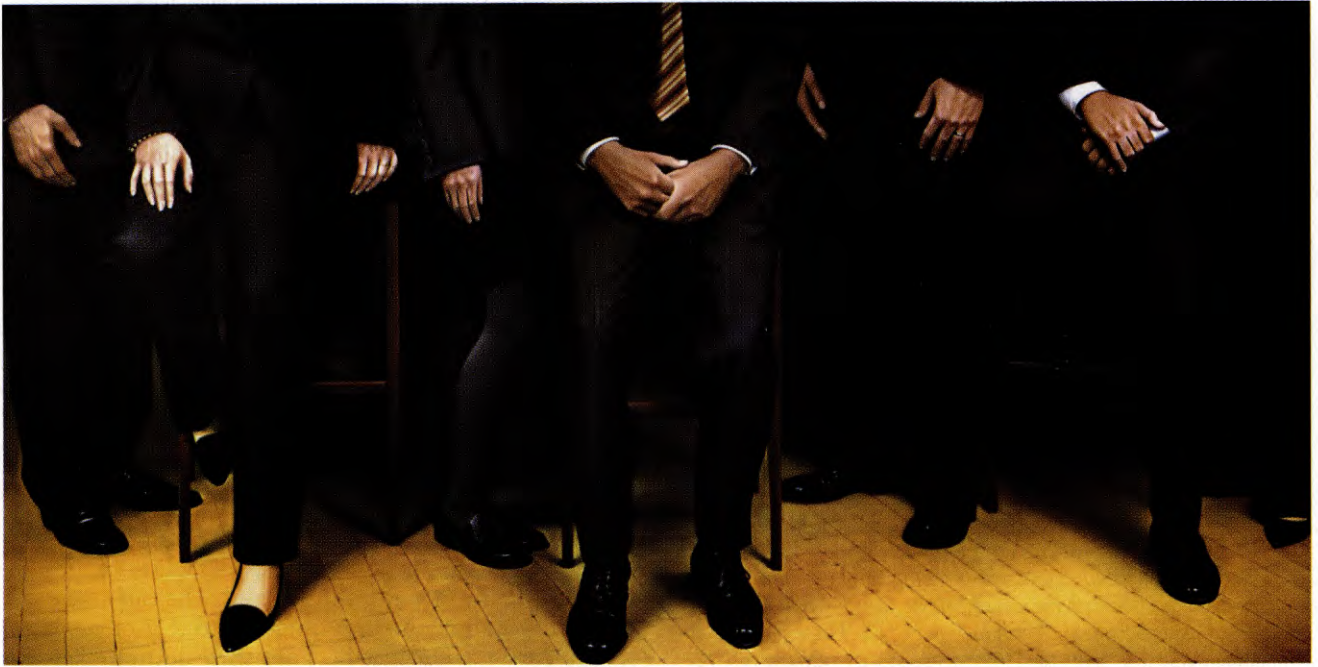
Management , by James Rieck, was on display this spring at Lyons Wier Ortt Gallery, in New York City.

the populace—Catholics in particular—to remote parts of the island. Then it would redistribute their lands to British troops, thus providing compensation to them and establishing an occupational presence for the benefit of the government in London. The task of creating an inventory of the lands went to an army physician by the name of William Petty, a quick study and a man with an eye for the main chance. He classified much land as marginal that actually was quite good. Then he got himself appointed to the panel that made the distributions and bestowed much of that land upon himself. Petty's survey was the first known attempt in Western history to create a total inventory of a nation's wealth. It was not done for the well-being of the Irish people but rather to take their land away from them. It was an instrument of government policy, and this has been true from that time to the present. Governments have sought to catalogue the national wealth for purposes of taxation, confiscation, planning, and mobilization in times of war. They have not designed these catalogues to be measures of national well-being or of quality of life. Yet that is how the national wealth inventories have come to be used, especially the GDP. Somehow the tool has become the task. This part of the story begins with the Great Depression.