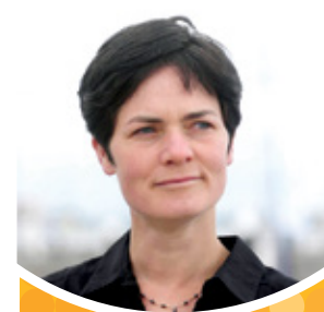
DAME ELLEN MACARTHUR CHAIR OF TRUSTEES ELLEN MACARTHUR FOUNDATION

The innovation I'm seeing at Kingfisher, and in pioneering businesses elsewhere, makes me optimistic for the future. When we started working on the concept of a circular economy, it immediately appeared as a tangible solution to the challenges brought about by resource constraints. Having demonstrated its potential and now seeing pioneering companies actively engaged in the transition, I have never felt more convinced.