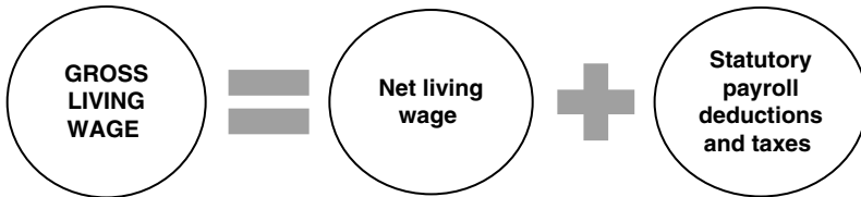
Figure 2.3 From net living wage to gross living wage