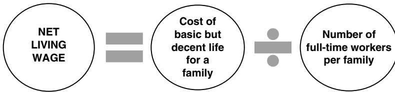
Figure 2.2 From cost of basic but decent life to net living wage