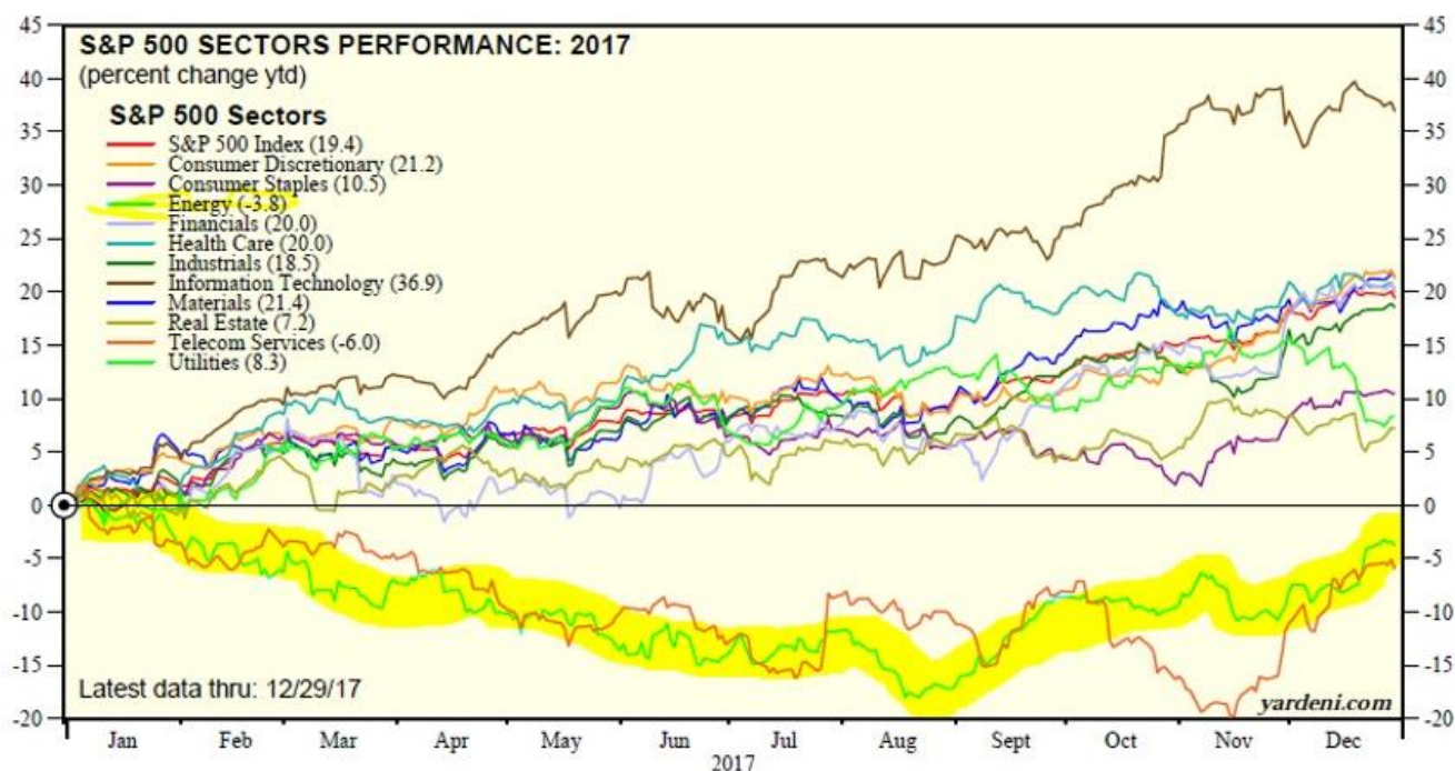
Figure 6: S&P 500 Sectors Performance 2017

The rebalancing of the NYS Common Retirement Fund would require investment managers to seek out investments that were likely to achieve the fund's annual investment return target of 7%. 87 The Global Analytics study fails to explain why the NYS CRF would rebalance its portfolio by specifically targeting investments with returns of 3% and 6%, both well below the fund's target of 7%. It also fails to explain how, in the current context, it would be difficult to find stocks that perform better than fossil fuel stocks, since during the last five years the energy sector has lagged the market. The assumption that a money manager would be retained by the fund to find investments below its annual investment target is extraordinary.