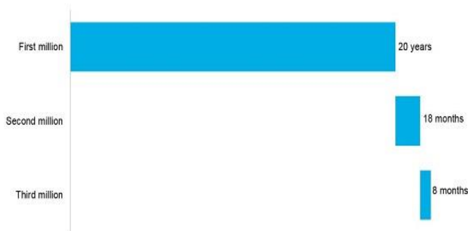
Figure 5: Electric Vehicle Sales Are Accelerating