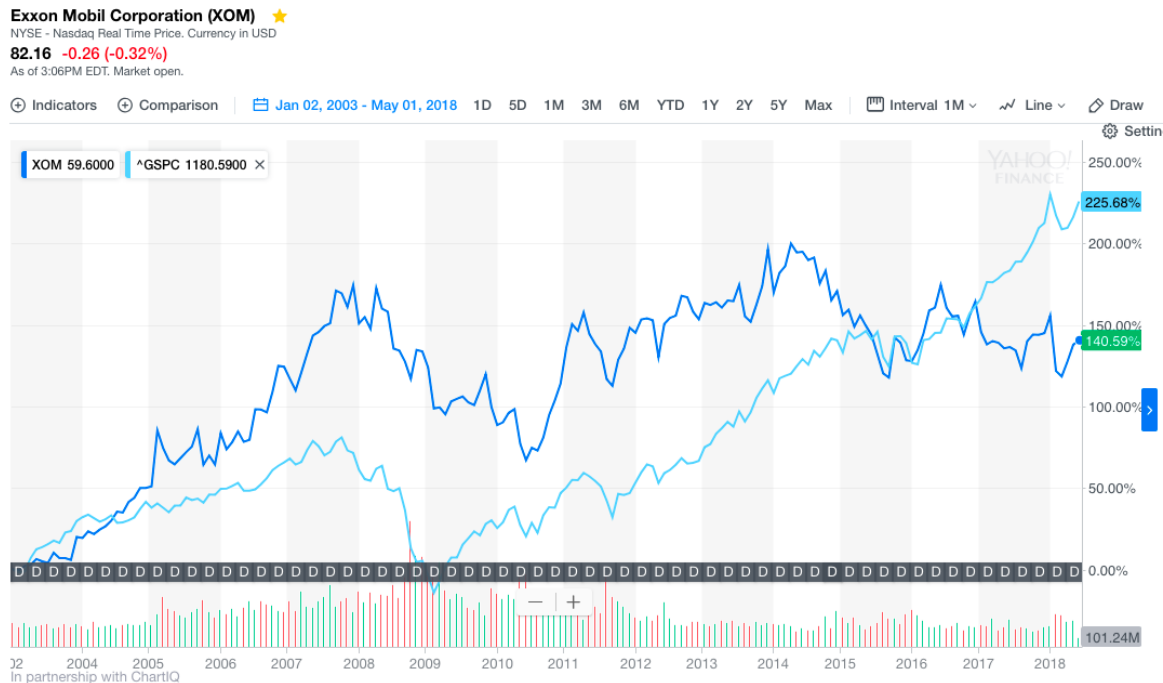
Figure 1: ExxonMobil Growth Compared to Standard and Poor's 500, 2003 to Present

As the driver of the global economy, fossil fuel companies also led the stock market. In the 1980s, for example, seven of the top 10 companies in the Standard and Poor's 500 Index were oil companies. Figure 1 below illustrates the sector's role (using ExxonMobil as a proxy) over the past 15 years.