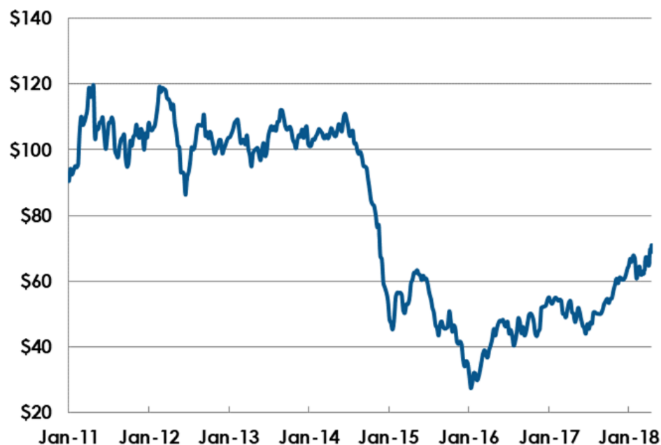
Figure 3: U.S. Oil Prices Adjusted for Inflation