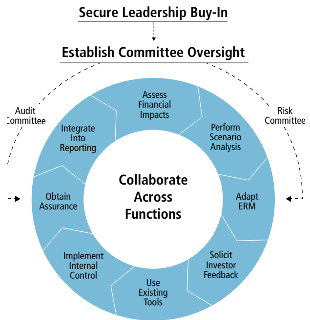
Figure 4. Action Steps to Lay the Groundwork

The following checklist, expanded and adapted from CDSB’s 2017 Practical Action TCFD Checklist, 24 details many of the key action steps companies can take now to prepare themselves for reporting information that is aligned with the TCFD recommendations (see Figure 4).