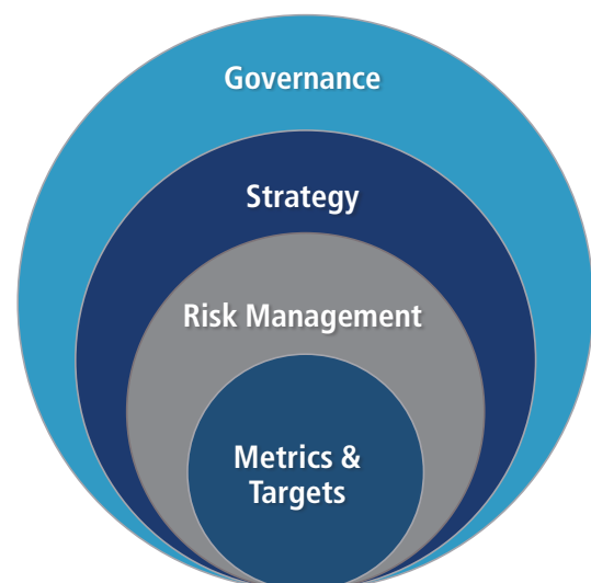
Figure 1. Four core elements of the TCFD recommendations