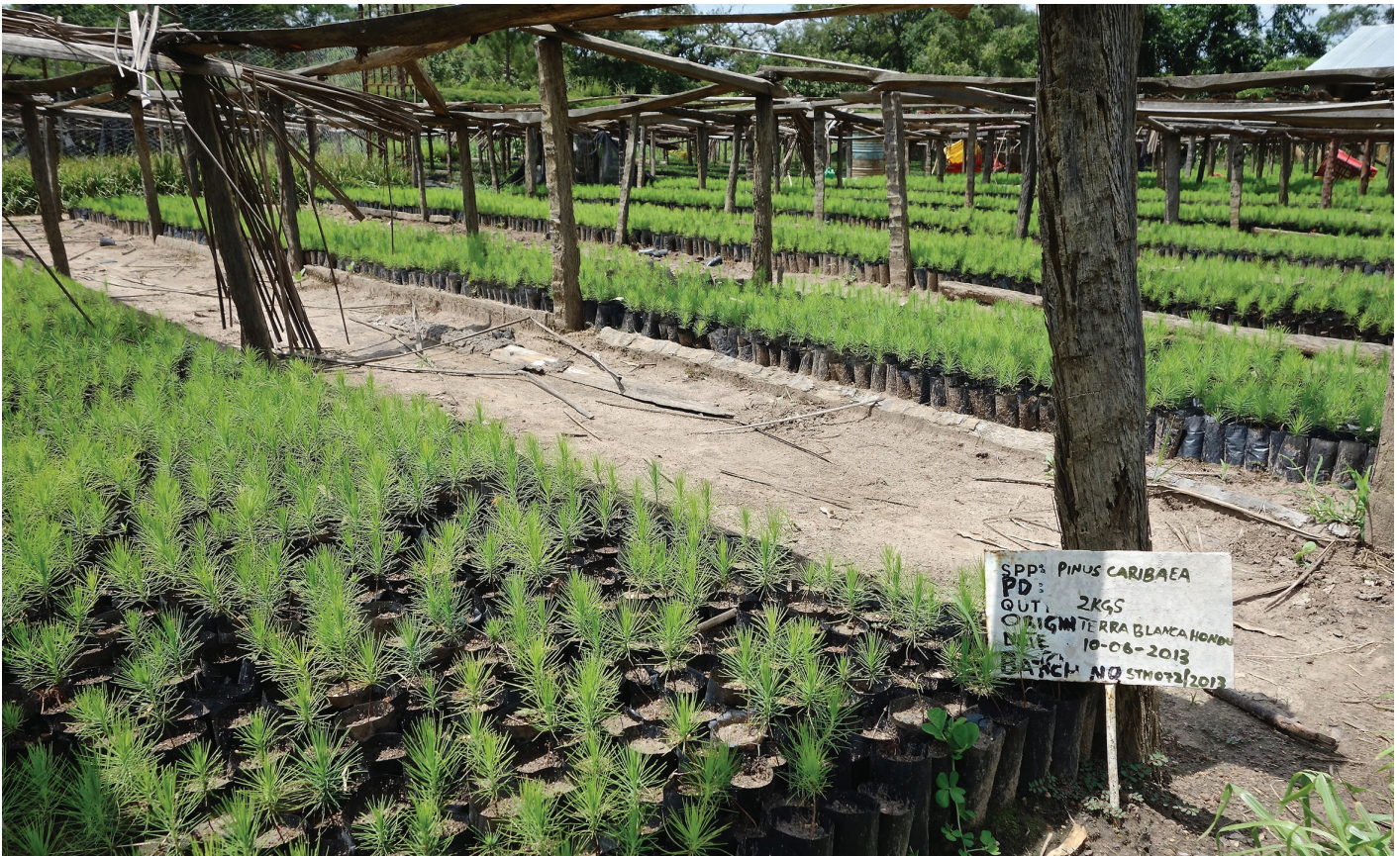
Seedling nursery at Bukaleba.