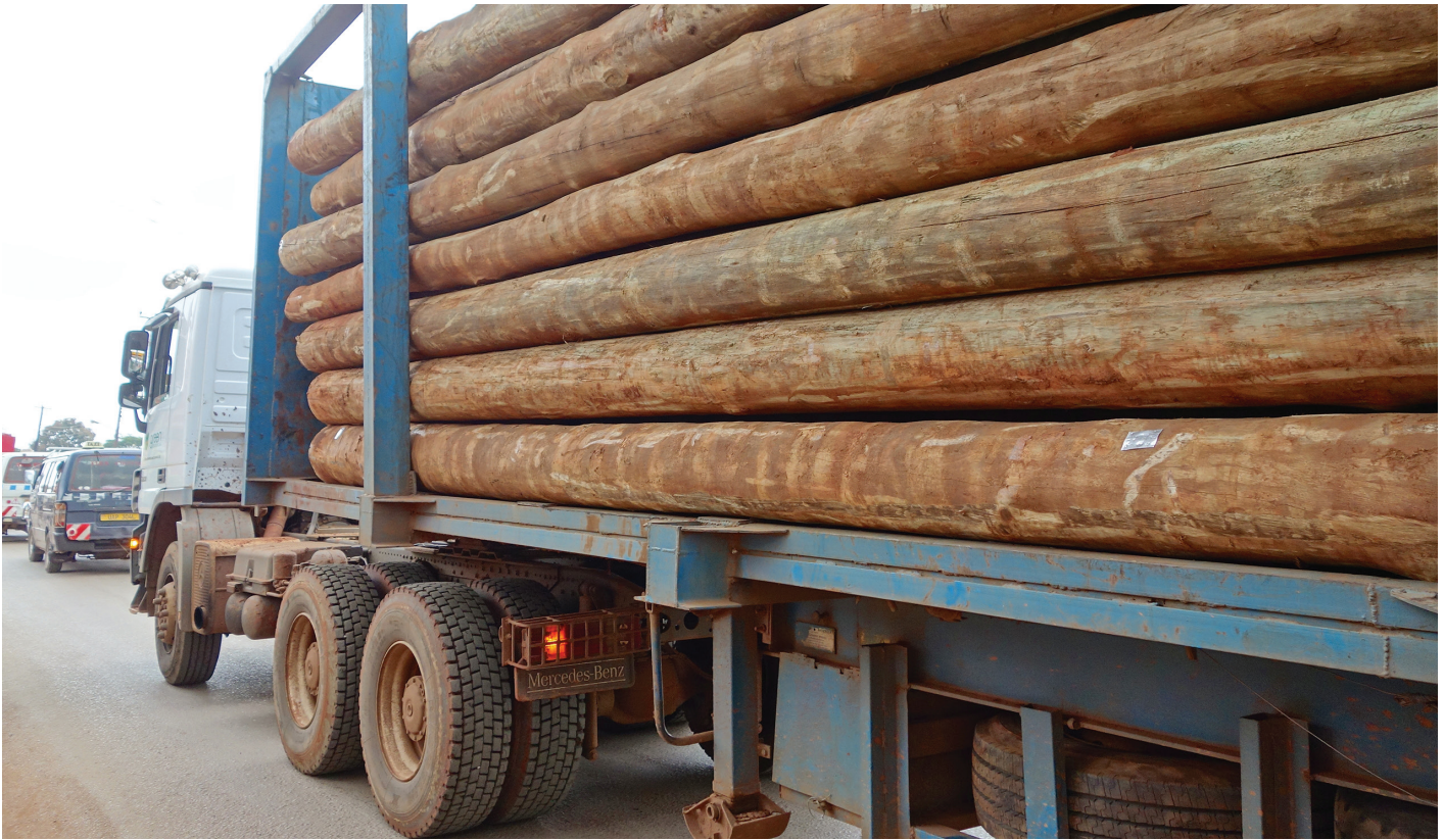
Green Resources' truck transporting logged timber.

international governance mechanisms, including the National Forestry Policy and New National Land Policy (Uganda), the Forest Stewardship Council (FSC), as well as broader mandates that bind countries to the “green economy” and foreign investment from national governments (including Uganda’s), the United Nations, the World Bank, etc.