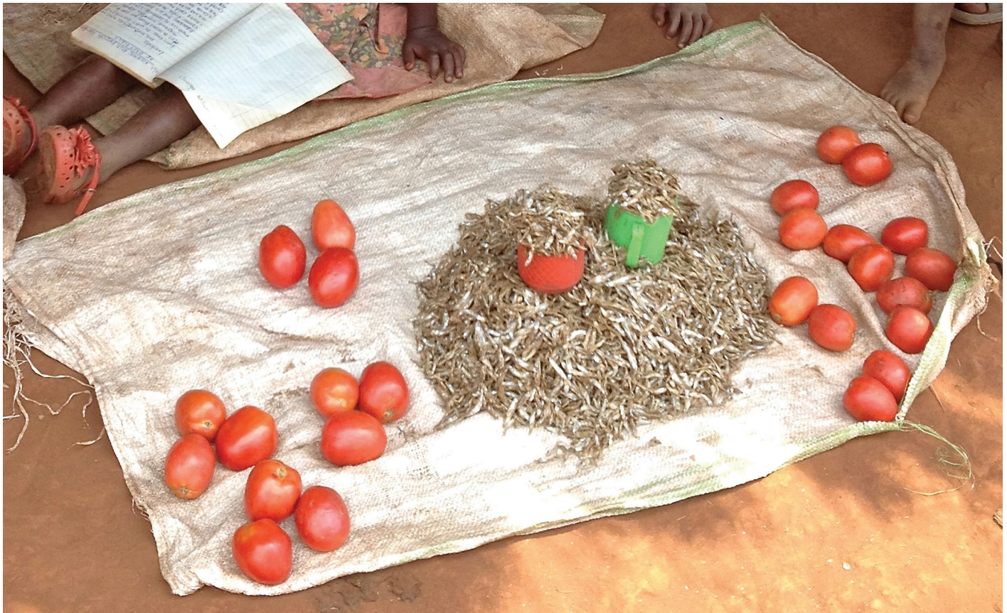
Growing and selling of food has become illegal in licensed areas.

company license areas. In one focus group discussion, people reported being harassed, fined, and jailed, with a number of people mentioning they knew someone who was imprisoned for “trespass.” 40 This violent defense of the company’s borders is not altogether surprising, given a 2012 report by the Norwegian Agency for Development Cooperation (NORAD) identifying the “invasion” of license areas by locals as responsible for low tree plantation growth rates. 41