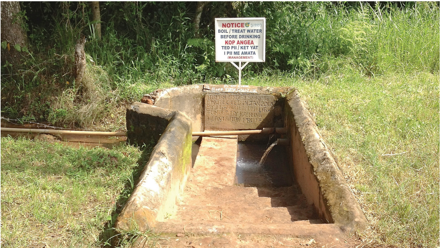
Bore funded by Green Resources.