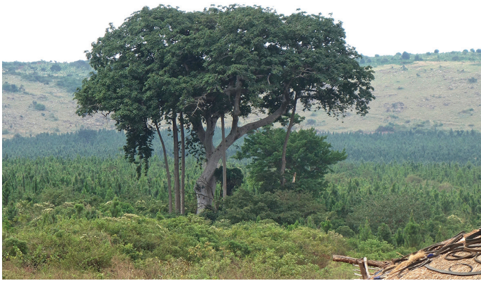
Plantation pines growing close to the sacred Walumbe Tree.