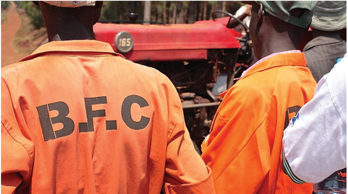
Busoga Forestry Company security uniform.

amongst local villagers about the changeable boundary of the designated community land, as well as who is eligible to access and use this land.