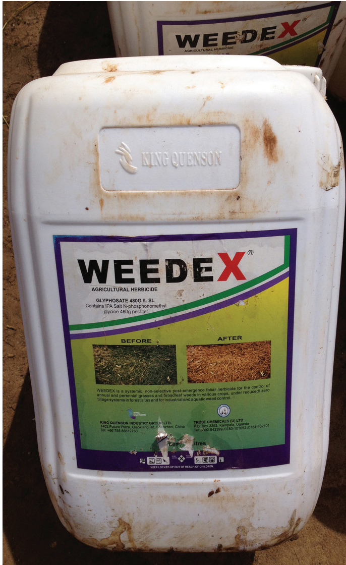
Glyphosate, a herbicide used at the seedling nursery Bukaleba.

There is a long history of violence associated with international development, including “green” development projects. Such violence has been understood in different ways, including as both direct , and structural violence. Carbon violence characterizes both the direct and structural violence that has arisen from carbon market schemes.