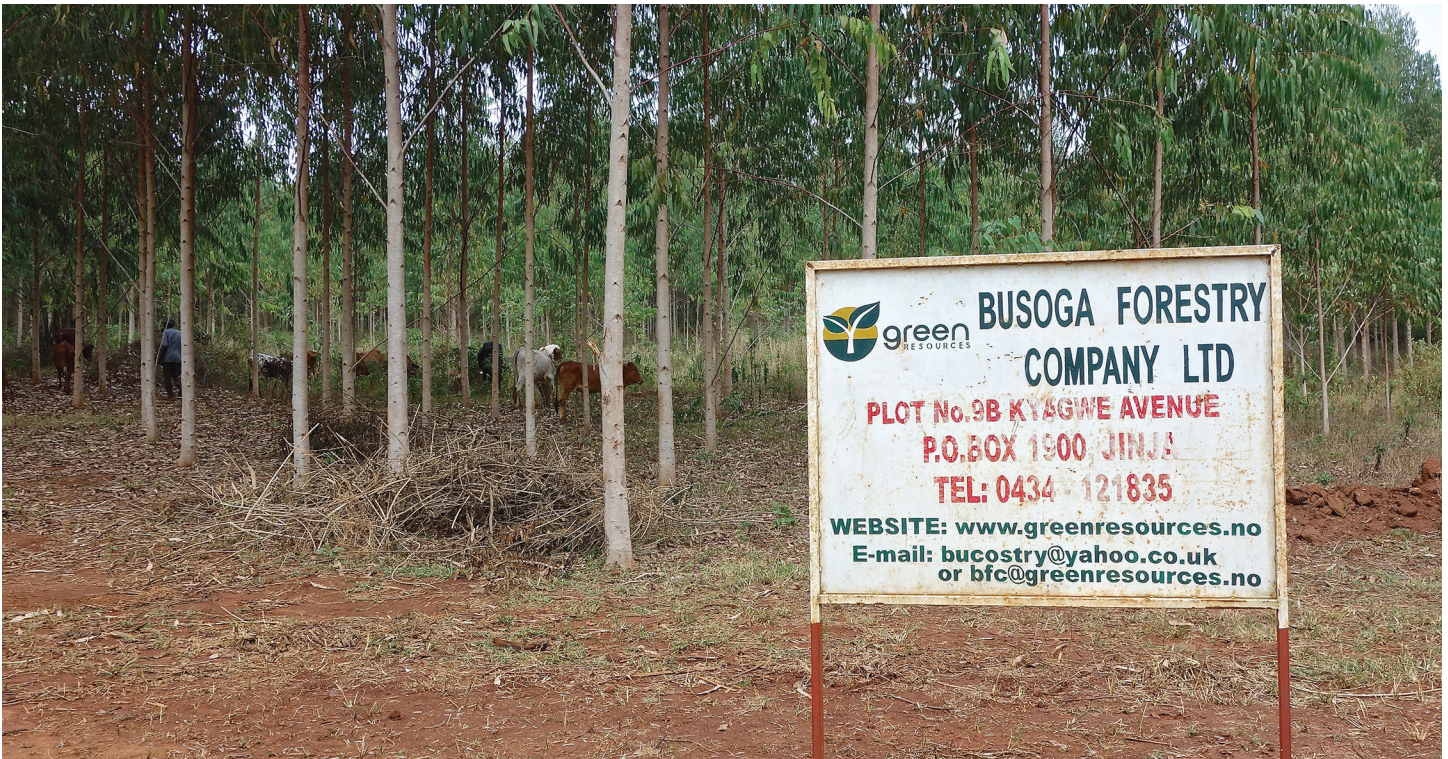
Cattle grazing illegally in plantation area.

them, once they have finished their season of planting, to go back to where they came from, as much as possible. We will try everything possible to make sure they don't come back. 45