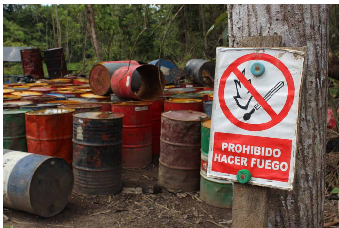
Crude oil barrels abandoned in the Peruvian Amazon.

long term,” he wrote, “environmental, social and governance issues — ranging from climate change to diversity to board effectiveness — have real and quantifiable financial impacts,” and he specifically mentions the Paris Agreement. 39 In September 2017, BlackRock launched its first-ever “socially responsible” equity fund that is also fossil fuel-free. 40 The company also recently hired a former Obama Administration climate change advisor to serve as its head of ESG investing. 41