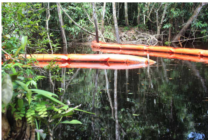
An oil spill in the Peruvian Amazon

Finally, as a U.S.-based institution, we believe that engaging the financial institutions that also call this country home is a crucial part of enacting change to prevent climate disaster, even in far-away lands like the Amazon rainforest. That is especially true given research conducted in 2016 and early 2017 23 that the majority of Amazon crude oil exports come to the U.S. — mostly to California — and is refined and sold here.