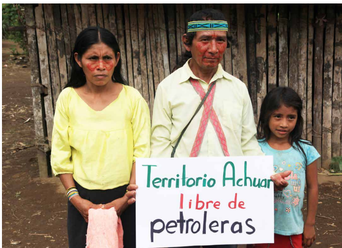
Achuar families demonstrate their rejection of oil drilling in their territory in October 2017

more in addendum, below). Some have even made investment changes, like JPMorgan's decision to phase out financing for coal mining. 11