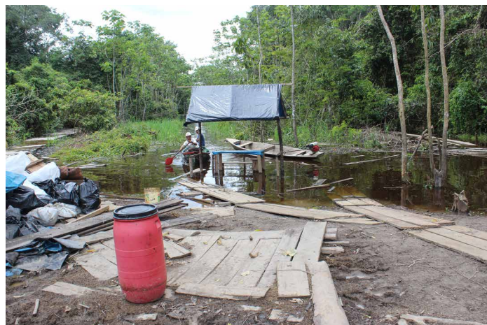
Oil spill clean-up in the Peruvian Amazon.

The movement opposing the Dakota Access Pipeline (DAPL) shed further light on the way in which fossil fuel projects -- and financial investments in these projects -- violate indigenous peoples’ right to FPIC regarding activities on their territories. 83 Despite various international frameworks guaranteeing FPIC, clear opposition by local indigenous communities, and explicit commitments by financial institutions to respect indigenous rights, financiers of DAPL poured money into the pipeline. The lack of a proactive response from operating companies, governments, and financial institutions spurred a global wave of indigenous-led organizing calling on financial institutions to divest from extractive projects on indigenous lands and urging municipalities to stop banking with financial institutions that bankrolled tar sands pipelines.