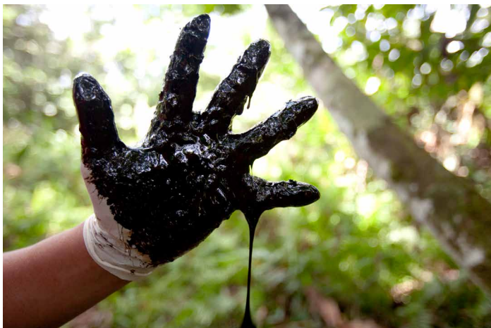
Crude contaminates the Ecuadorian Amazon in an open pool abandoned by Texaco and never remediated.