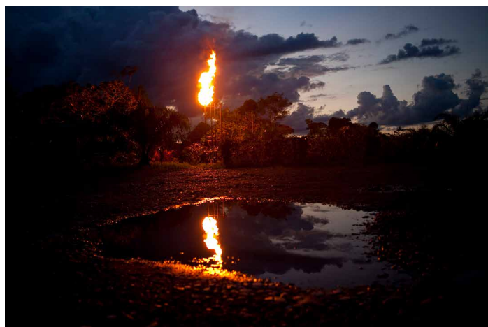
Oil waste pit in Ecuador’s northern Amazon.

Furthermore, such projects carry environmental risk that affects the financiers of these projects. As BlackRock CEO wrote in his 2016 letter to CEOs, short-term profit-