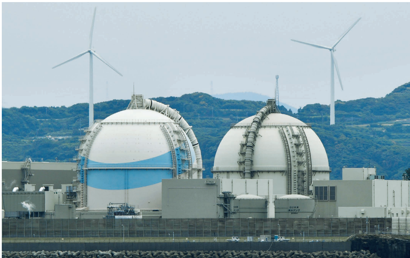
Japan is making efforts to restart some of its nuclear reactors, including reactors No. 3 and No. 4 at the Genkai power plant in Saga, Kyushu.